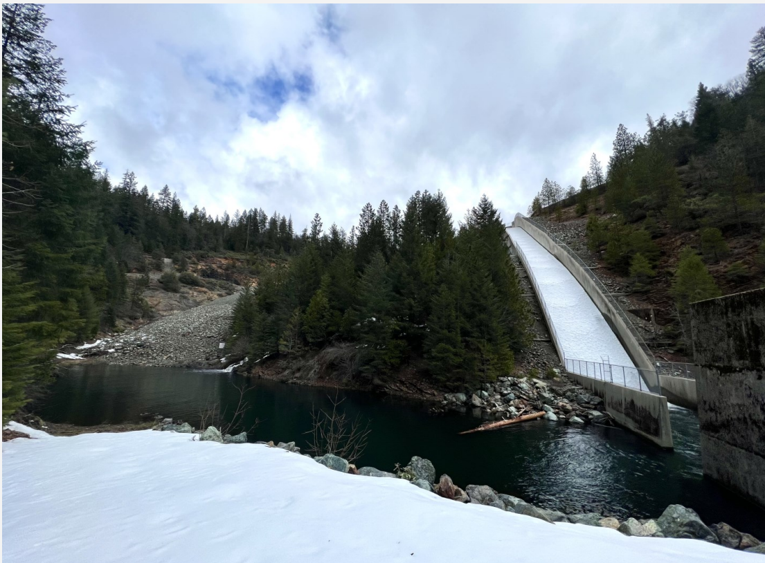
Sugar Pine Spillway 4/2/2023