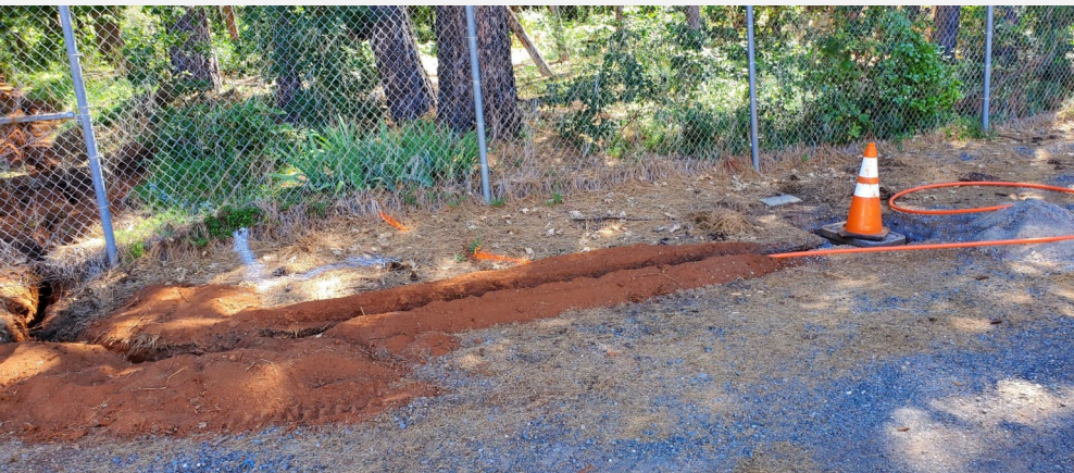
Working Together To Improve Emergency Response

Two community-minded utility companies have improved the emergency response communication for Foresthill. Fiber internet is a broadband connection that reaches higher speeds than wireless networks. Better reliability for communications via cell phone, pager, alarm system and all other call out devices. Operators will have access to call out information while working in the plant and around the community.